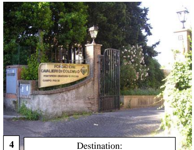
Destination: PETRIANA (Cavalieri di Colombo)