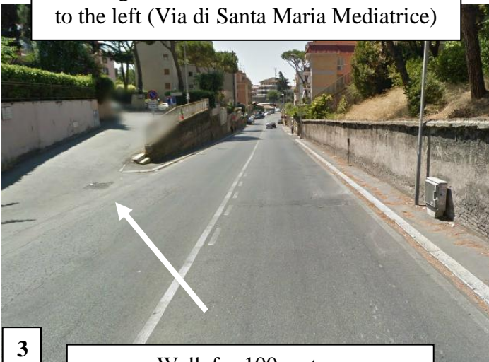
Walk for 100 meters