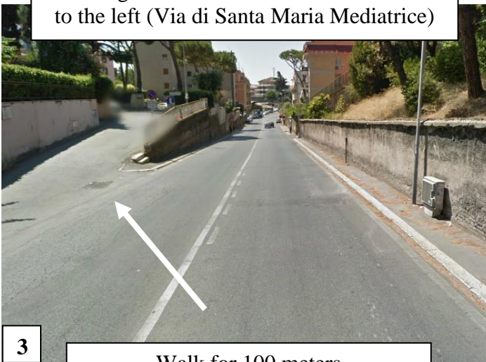
Walk for 100 meters